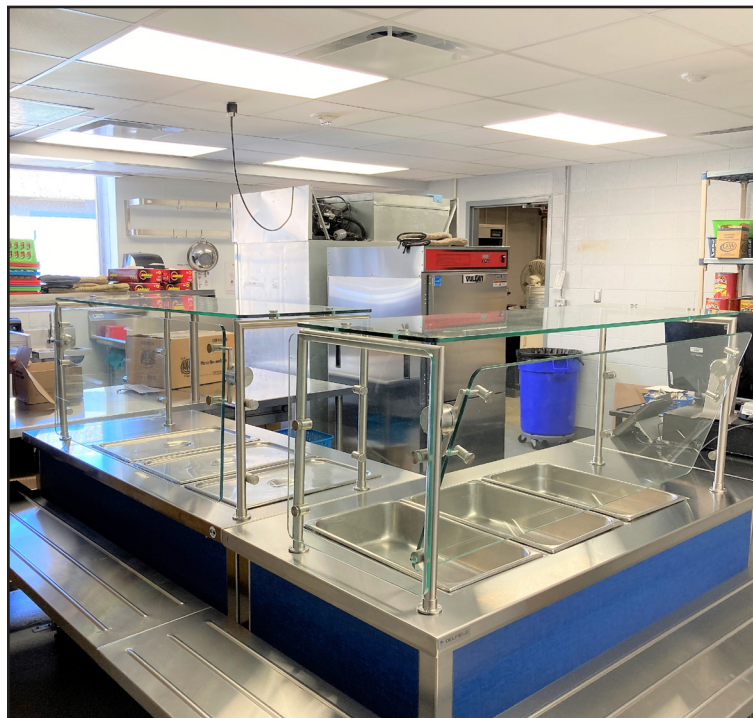
New kitchens are part of the 2021 Bond projects.

For more information about the 2021 bond projects, please visit livoniapublicschools.org and click on the Our District tab.