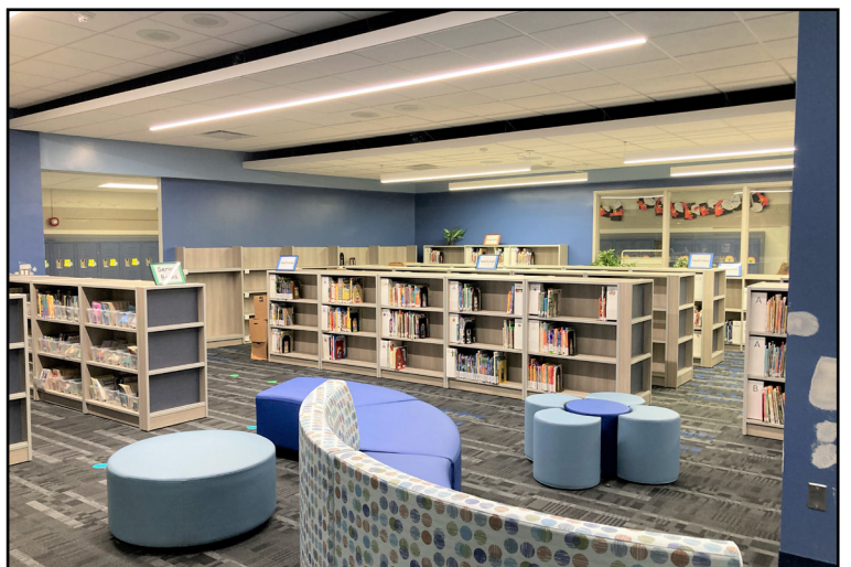
Newly-redesigned Library Media Center at Randolph.