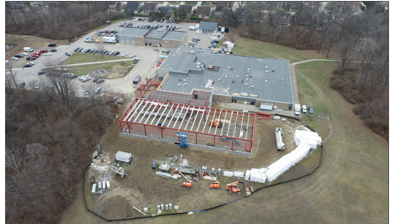
Aerial view of the LCTC expansion, which includes robotics.

The LMCs, for example, are designed to be centers for student collaboration and innovation. Features include intentionally designed furniture and spaces for students to work together on projects; an Idea Factory for hands-on learning; group meeting spaces for media/technology group instruction and small spaces for quiet reading.